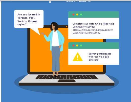
"This project is made possible by the Ministry of the Solicitor General in the form of direct support from The Safer and Vital Communities Grant."

anonymously capture the voice of community members in Toronto, Peel region, York region and Ottawa on hate incident reporting. What is a hate incident? Where do hate incidents occur? Why do some in the community report hate incidents while others do not? How can hate incident reporting be improved upon? This survey only takes 5-10 minutes to complete, and those who complete the survey will receive a $10 gift card as an honorarium.